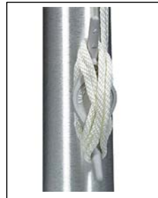
Heavy Duty Cleat