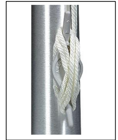
Heavy Duty Cleat